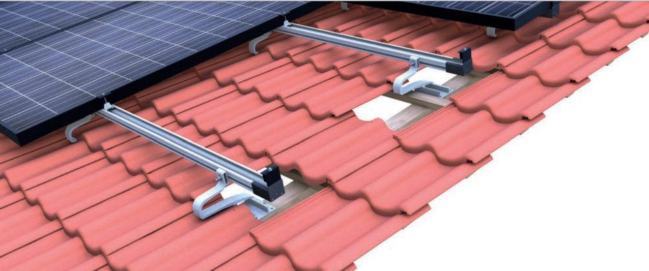
novotegra side-fix – single-rail clamping system with modules installed in portrait