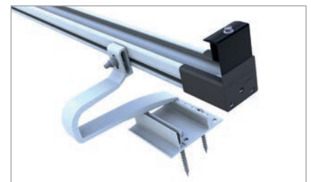
End clamp and end cap in C-N-rail