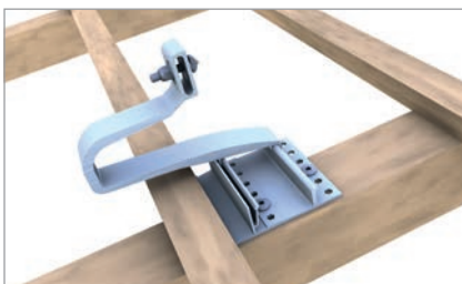
Position of base profile on rafters